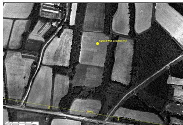
Figure 1 & 2 – Mukhiani Well site location on the Vani 3 Prospect